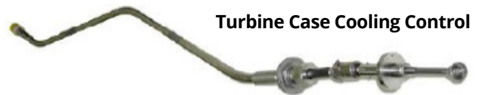
Turbine Case Cooling Control